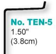
No. TEN-5 1.50" (3.8cm)