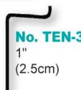
No. TEN-3 1" (2.5cm)