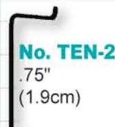
No. TEN-2 .75" (1.9cm)

These tools are designed for use on lever-type letterbox locks. They apply tension on the levers, while moving the levers to the shear line, opening the lock.