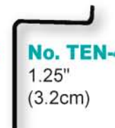
No. TEN-4 1.25" (3.2cm)