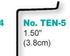
No. TEN-5 1.50" (3.8cm)