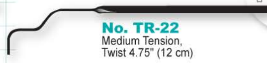
No. TR-22 Medium Tension, Twist 4.75" (12 cm)