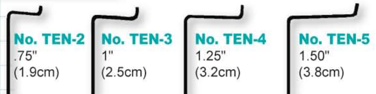
No. TEN-2 .75" (1.9cm)

These tools are designed for use on lever-type letterbox locks. They apply tension on the levers, while moving the levers to the shear line, opening the lock.