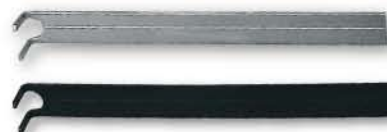
No. TEN-7 (Zinc Plated, Medium Tension)

These tension tools are for use on double-sided locks such as automotive door locks, furniture, cabinets and other cam locks.