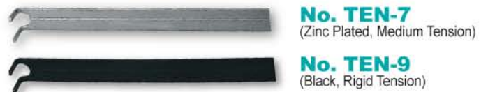
No. TEN-7 (Zinc Plated, Medium Tension)

These tension tools are for use on double-sided locks such as automotive door locks, furniture, cabinets and other cam locks.