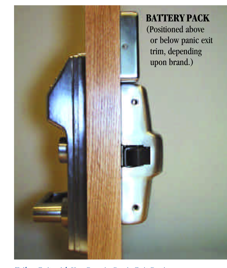
TrilogyExit with Von Duprin Panic Exit Device shown in profile on 13/4" thick door.