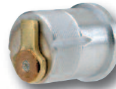
Rear Plus Housing Screw-on Cam C16CR-27x001