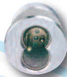
Front Plus Housing C16CR-27x (Cam)