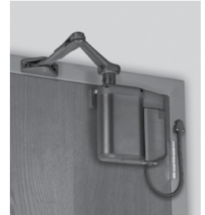
Pull Side Mounting with ADA1015P Hardwire Kit