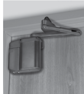
Push Side Mounting without electrical power