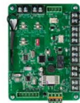
Order separately using p/n ADA1028