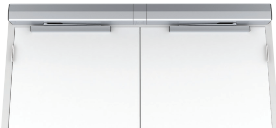
Full-length, modular backplate and cover spans a pair of doors