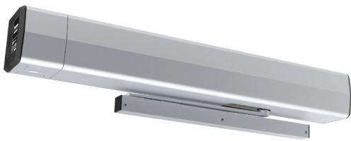
32" length, single unit

Superior door control for rigorous, high-use applications