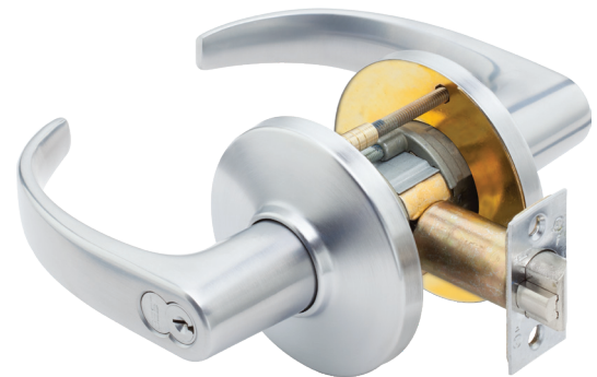
BEST 9K Series Heavy Duty Cylindrical Locks

Depending on the microorganism, Agion's antimicrobial technology has been shown to initially reduce microbial population within minutes to hours while maintaining optimal performance for years.